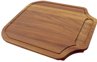
Iroko-wood chopping board 8655 000